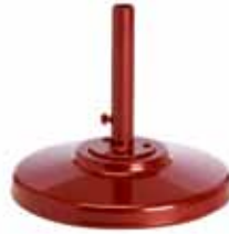
Standard Umbrella Stand for 1-1/2" Pole / Available in all finishes 1390-9726 65 lb 19 round x 17h 1390-9727 95 lb 24 round x 17h