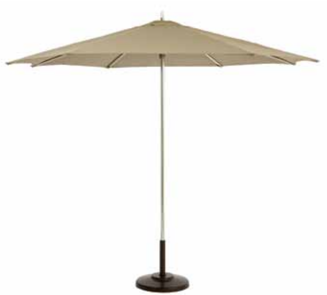
1390-9817 9' x 11' Oval / Single Vent / Auto-Loc-Pulley / 1-1/2" Piece Pole 108w x 132l x 96h