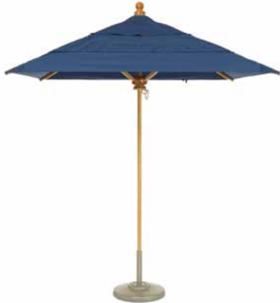
WOOD POLE CONTRACT MARKET UMBRELLA 1390-0009 7' Square / 1-1/2" Pole / Rotating Double Vent Canopy / Manual Lift 84w x 84l x 105h