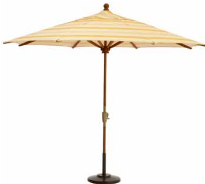
1390-9682 9' Octagon / 1-1/2" Natural Ash KD Pole / Crank Opening System With Closing Brake Assist / Single Vent Canopy 108w oct x 102h 1390-9684 9' Octagon / 1-1/2" Teak KD Pole / Crank Opening System with Closing Brake Assist / Single Vent Canopy 108w oct x 102h