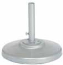
1390-9728 95 Lb Standard Umbrella Stand for 2" Pole / Available in all finishes 24 round x 17h