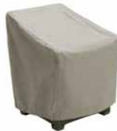
Custom Fitted Furniture Covers See Price List Addendum for more information