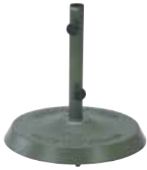
Traditional 'Brown Jordan' Umbrella Stand for 1-1/2" Pole / Available in all finishes 1390-9720 65 lb 22 round x 22h 1390-9723 80 lb