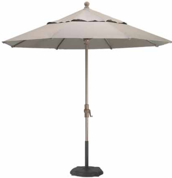
Crank Opening w/ Closing Brake Assist / 1-1/2" KD Pole / Auto Tilt Mechanism, available in Walnut or Graphite 1390-9823 9' Octagon 108w oct x 102h

Available in Suncloth® or Versatex® mesh.