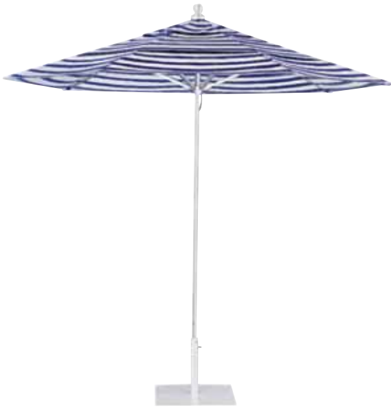
METAL POLE CONTRACT MARKET UMBRELLAS 8-1/2' Octagon / 1-1/2" Brushed Aluminum Pole / Manual Lift / Rotating Double Vent Canopy 102w oct x 107h 1390-0049 Aluminum Ribs 1390-0050 Pultrusion Ribs

Available in Suncloth® or Versatex® mesh.