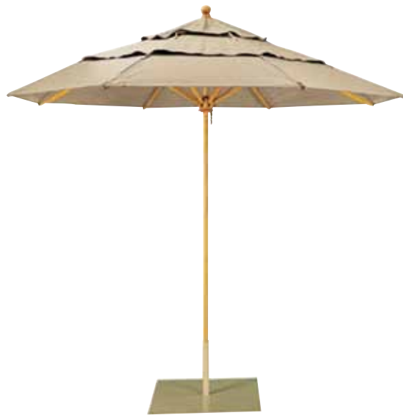
WOOD POLE CONTRACT MARKET UMBRELLA 1390-0048 8 1/2' Octagon / 1-1/2" Pole / Rotating Double Vent Canopy / Manual Lift 96w oct x 107h