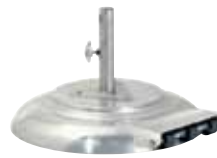
1390-9716 95 Lb Deluxe Umbrella Stand with Wheels / 1-1/2" Pole - Cement Filled Aluminum 24 round x 14h