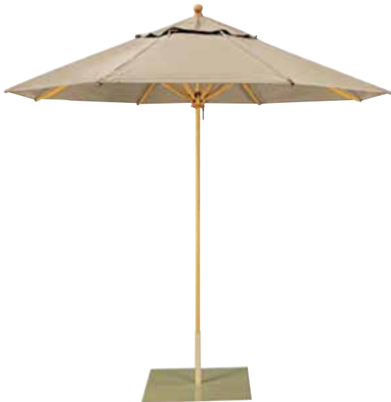
WOOD POLE CONTRACT MARKET UMBRELLAS 8' Hexagon / 1-1/2" Ash Pole / Single Vent Canopy 96w hex x 102h 1390-0030 Manual Lift 1390-0031 Pulley Lift